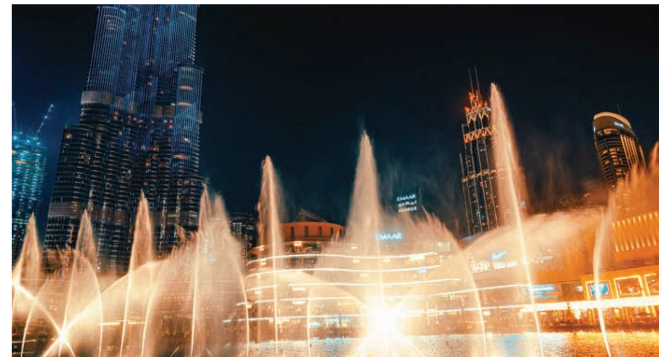
*Attributable to Owners