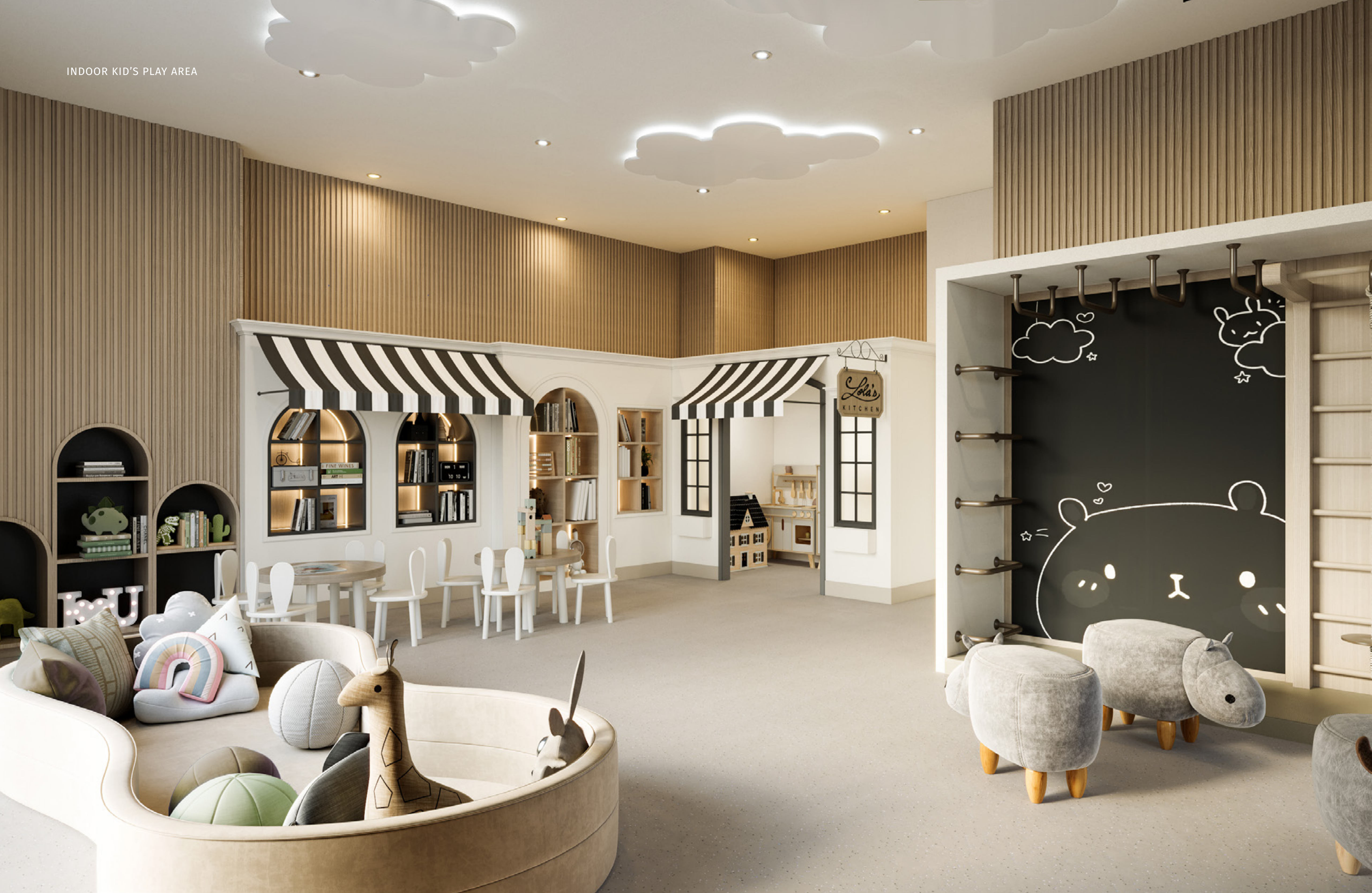
INDOOR KID'S PLAY AREA